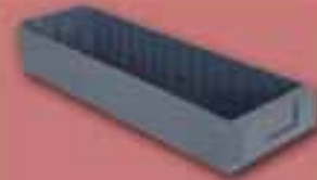
40433 Replacement 5.6" Extra Long Bins 2.75"H x 5.6"W x 18"D