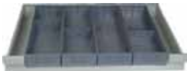
Bin drawer with XL bins

Bin transfer cart options also available