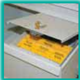
MOT Narcotics Box

SL270MOT (pictured) Standard Line cart with BeST® Lock on cabinet. Narcotics box with Illinois lock in top 9" drawer. Capacity of 270 Medicine-on-Time® cards.