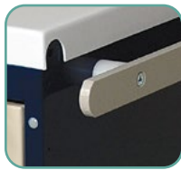
(3) 12" Side Rails (SIDERAIL12)