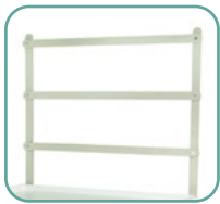
3-Tier Back Rail (MD30-RBR3)