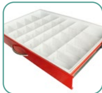
(2) Standard 3"Drawer Divider with Tray (MD30-TRAYDIV3-S)

Color shown is Navy. More than 20 additional colors are available.