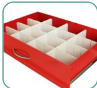
(1) Basic 6" Drawer Divider (MD30-DIV6-B)