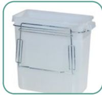
Plastic Waste Container (MD-3GALWASTEDM)