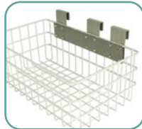
Large Utility Basket (BASKET3RC)