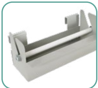
Tape and Label Dispenser w/Rail Clips (LABELDISP)