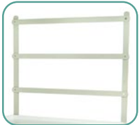
3-Tier Back Rail (MD30-RBR3)

All dimensions are available in the "MA-Dims-30wide-5caster.pdf" document. Shipping weights can be found at the online product listing for this model, or feel free to request them from your Harloff Team.