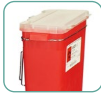
Sharps Container w/Wire Holder (MD-SHARPS-RC)