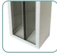
Catheter Box w/ Rail Clip (CATHBOX18RC)