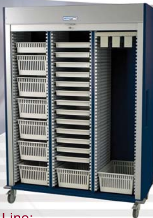
MS8160-CYSTO Mobile Supply Cart