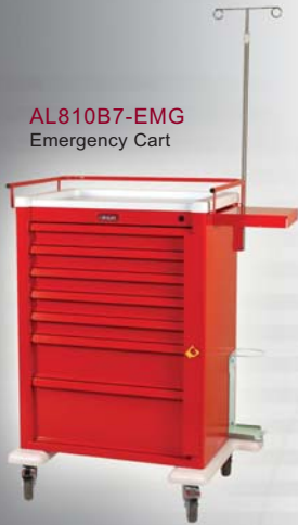
AL810B7-EMG Emergency Cart