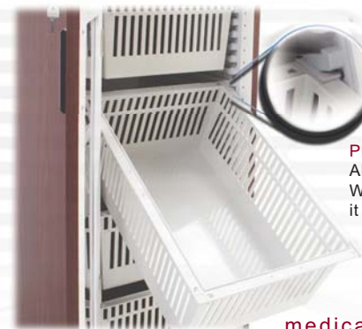
Pull-Out Stoppers Allow Angled View of Whole Tray Without it Falling Out