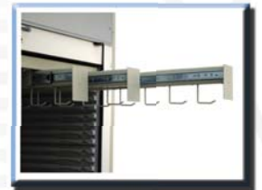
Easily Add a Cath Shelf Optimize Your Storage Solution