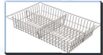
Wire Baskets Choice of 3 Heights with Optional Dividers