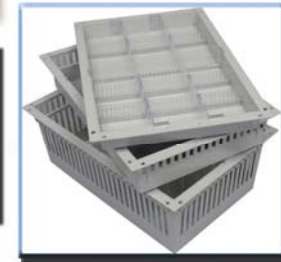
Choice of Heights & Configurations Various Clip on Labeling Solutions