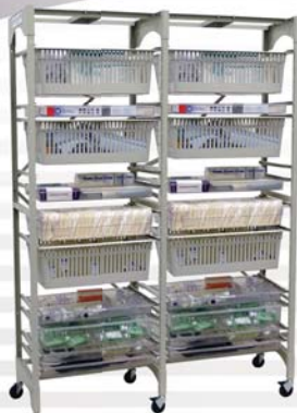
MOS7626-2COL Open Frame Storage Cart