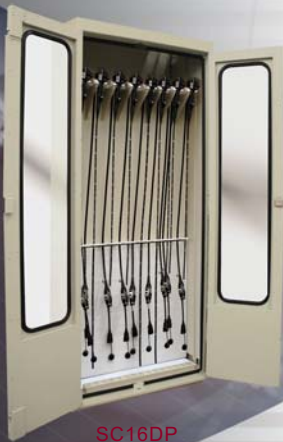
SC16DP Scope Storage Cabinet