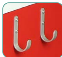
(2) Utility hooks (UHOOKS2)