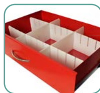
(1) Basic 6" Drawer Divider (MD30-DIV6-B)