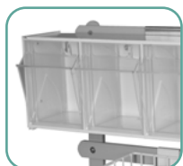
5-Compartment Tilt Bin w/Rail Clips (TILTBIN5RC)