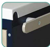
(3) 12" Side Rails (SIDERAIL12)