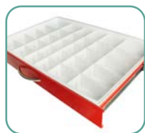
(1) Standard 3" Drawer Divider with Tray (MD30-TRAYDIV3-S)