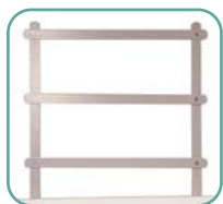
3-Tier Back Rail (MD30-RBR3)