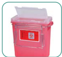
Sharps Container w/Wire Holder (MD-SHARPS-RC)