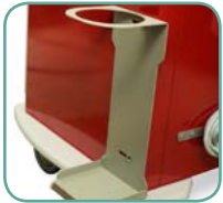
Oxygen tank holder (O2HLDR)