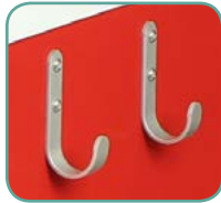
(2) Utility hooks (UHOOKS2)