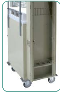
4-Scope Capacity Side Scope Cabinet (680350)