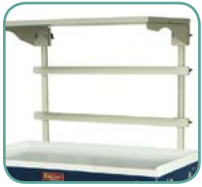
Adjustable Overhead Shelf (MD30-ADJSHLF2)