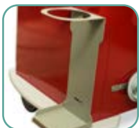
Oxygen tank holder (O2HLDR)