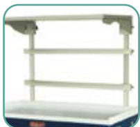
Adjustable Overhead Shelf (MD30-ADJSHLF2)