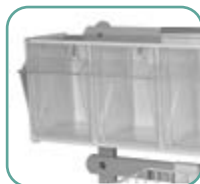
5-Compartment Tilt Bin w/Rail Clips (TILTBIN5RC)