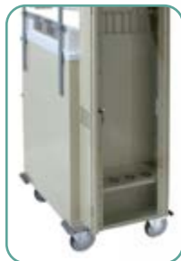
4-Scope Capacity Side Scope Cabinet (680350)