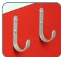
(2) Utility hooks (UHOOKS2)