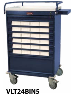
• Med-Bin Carts- 12-54 Bins