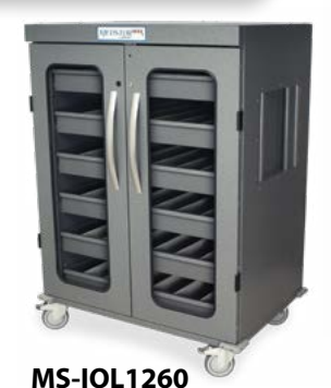
• Intraocular Lens Carts